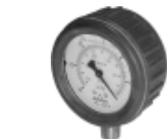
Install Before Assembly.